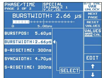
... or burst and sync pulse