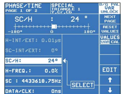
... and enable time-related settings such as phase and reference clock ...