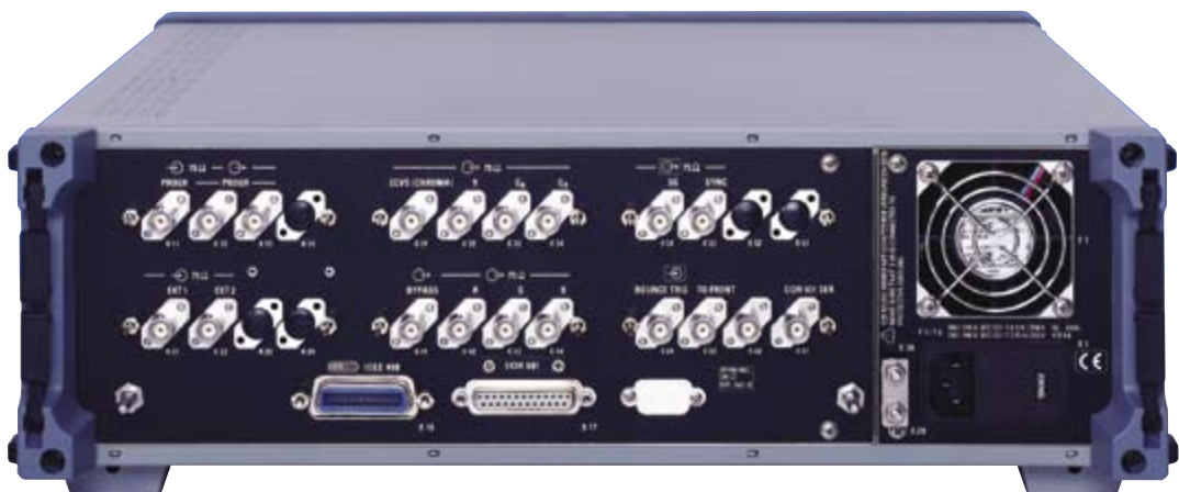
Rear view of the R&S SAF

Each of the 12 signal groups consists of up to eight signal menu pages; each page may contain seven signals