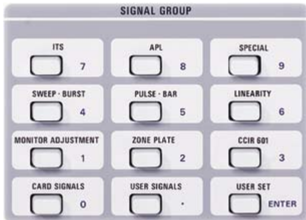
Twelve different signal groups can be called up via the front panel