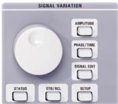
The different setting menus can be called up at a keystroke